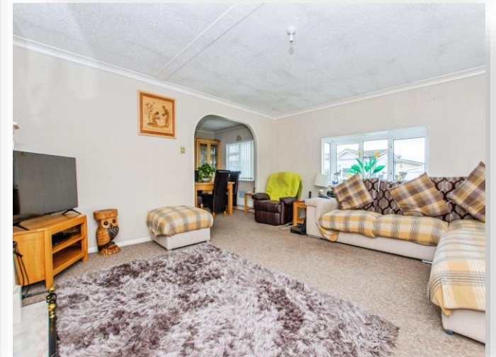
Osborne Park, Osborne Road, Wisbech PE13 3JY