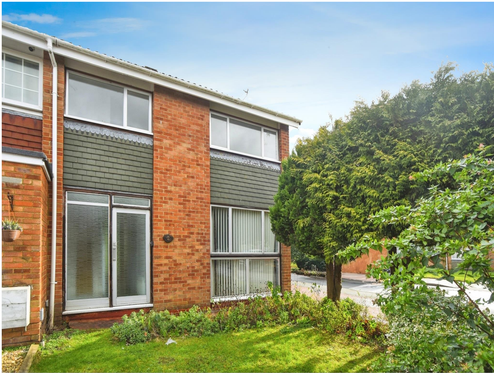
Cole Close, Swindon SN3 5BU