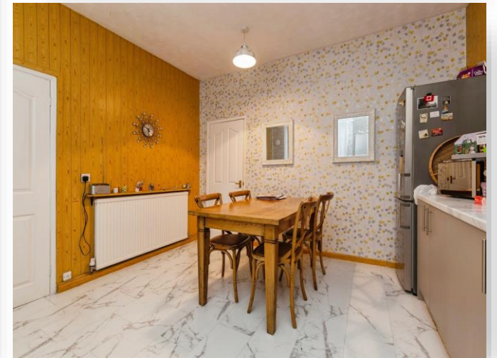
Middlegate, Hartlepool TS24 0JD