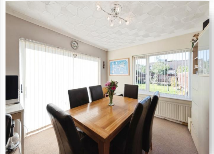
Silverdale Drive, Waterloo PO7 6DN