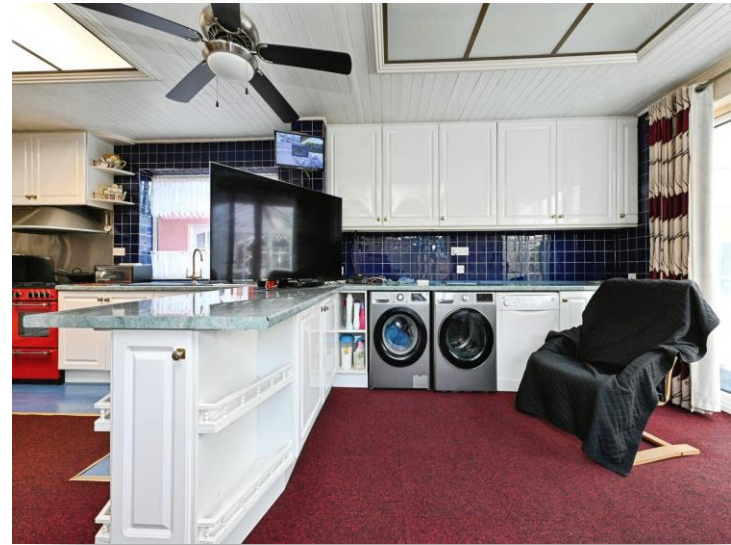
Oakview, Manor Road, North Wootton, King's Lynn, PE30 3PZ