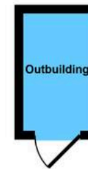
Outbuilding Approx 2 sq m / 24 sq ft