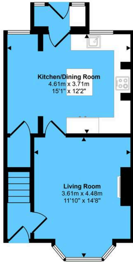
Ground Floor Approx 39 sq m / 416 sq ft

Approx Gross Internal Area 83 sq m / 894 sq ft