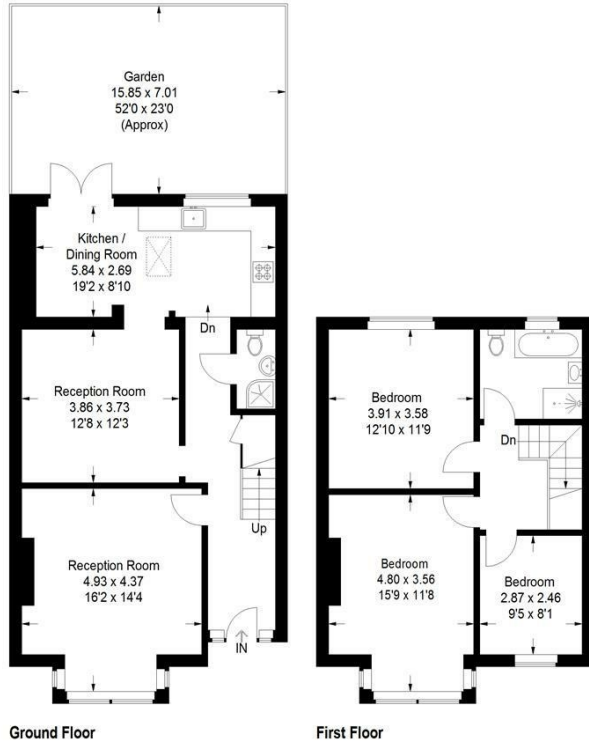
Illustration for identification purposes only, measurements are approximate.