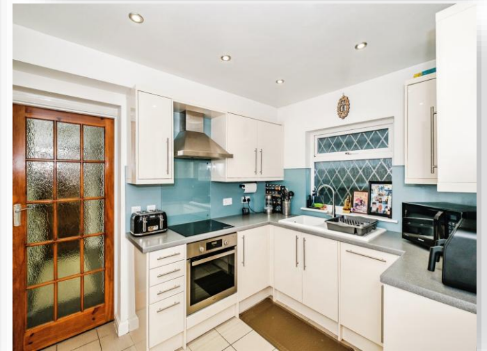
Upper Brighton Road, Sompting Lancing BN15 0JQ