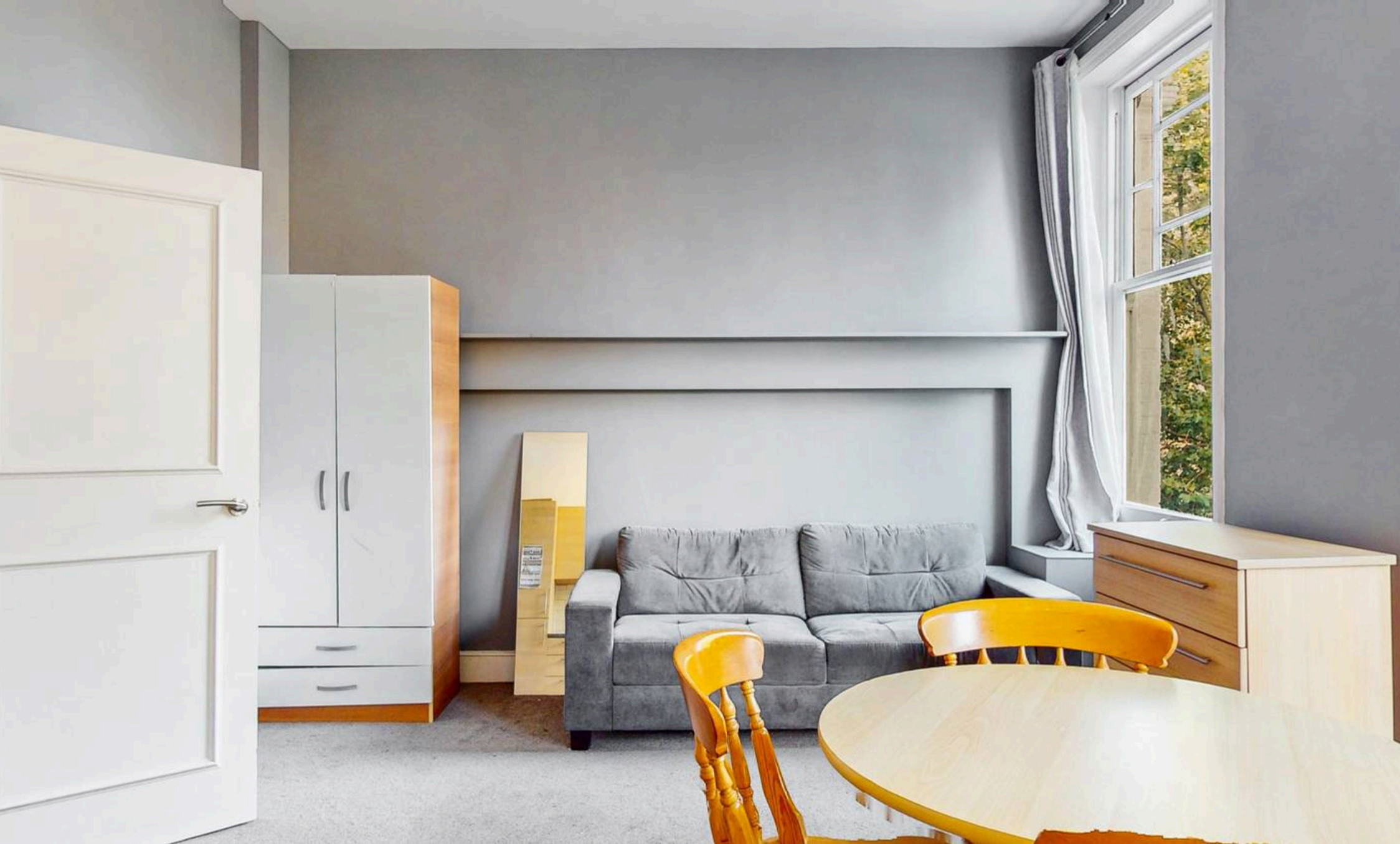
Harvist Road, Queens park, Nw6 £2,800 pcm