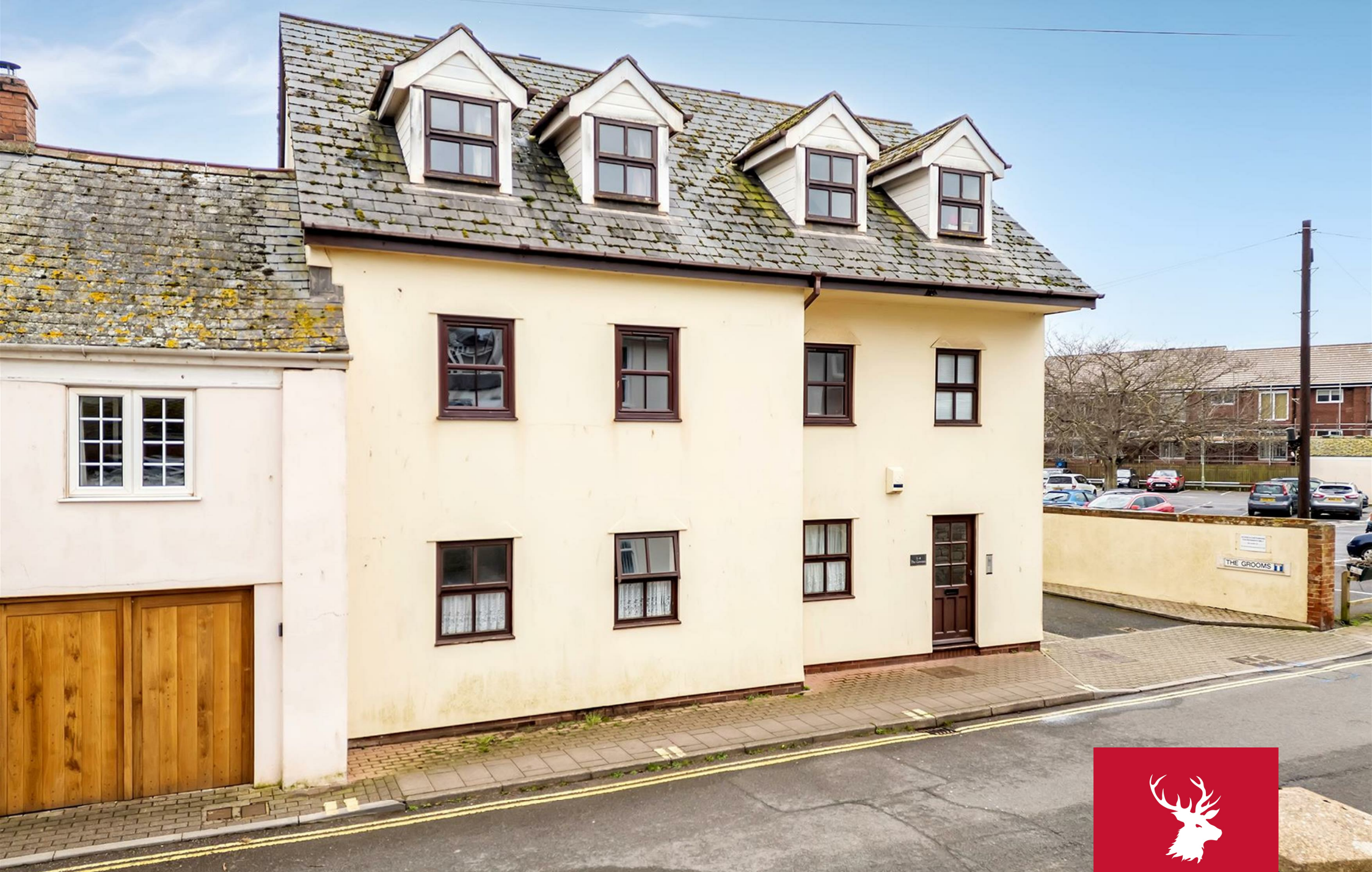
1, The Grooms