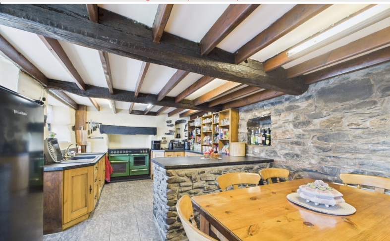
Kitchen Diner from Dining Area