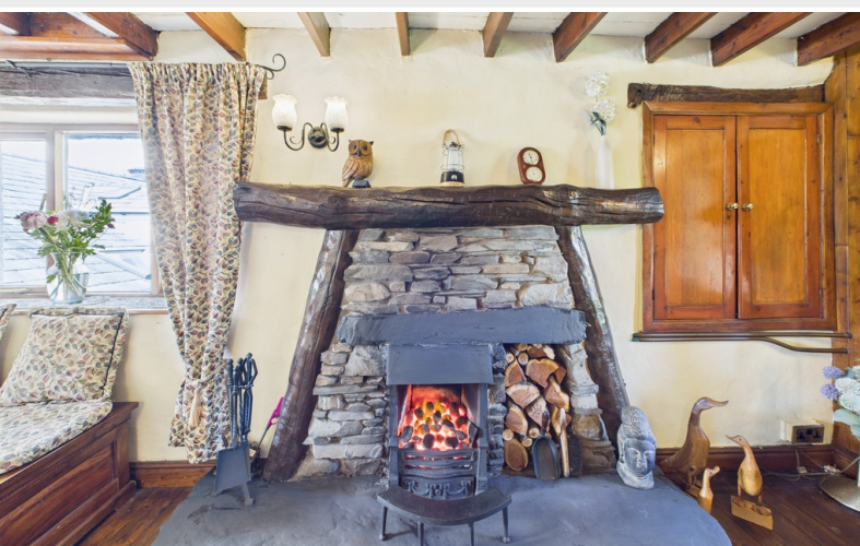
Original Open Fireplace