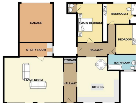
GROUND FLOOR 1315 sq.ft. (122.2 sq.m.) approx.