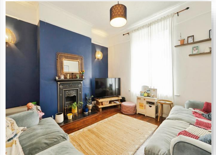
Westover Road, LEEDS LS13 3PB