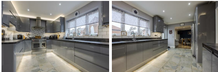
Kitchen 17'10" x 9'6" (5.45 x 2.92)