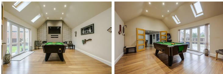
Billiard room 19'3" x 15'0" (5.88 x 4.59)