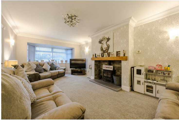
Lounge 20'0" x 12'0" (6.10 x 3.66)