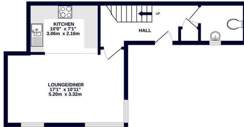
GROUND FLOOR 463 sq.ft. (43.0 sq.m.) approx.