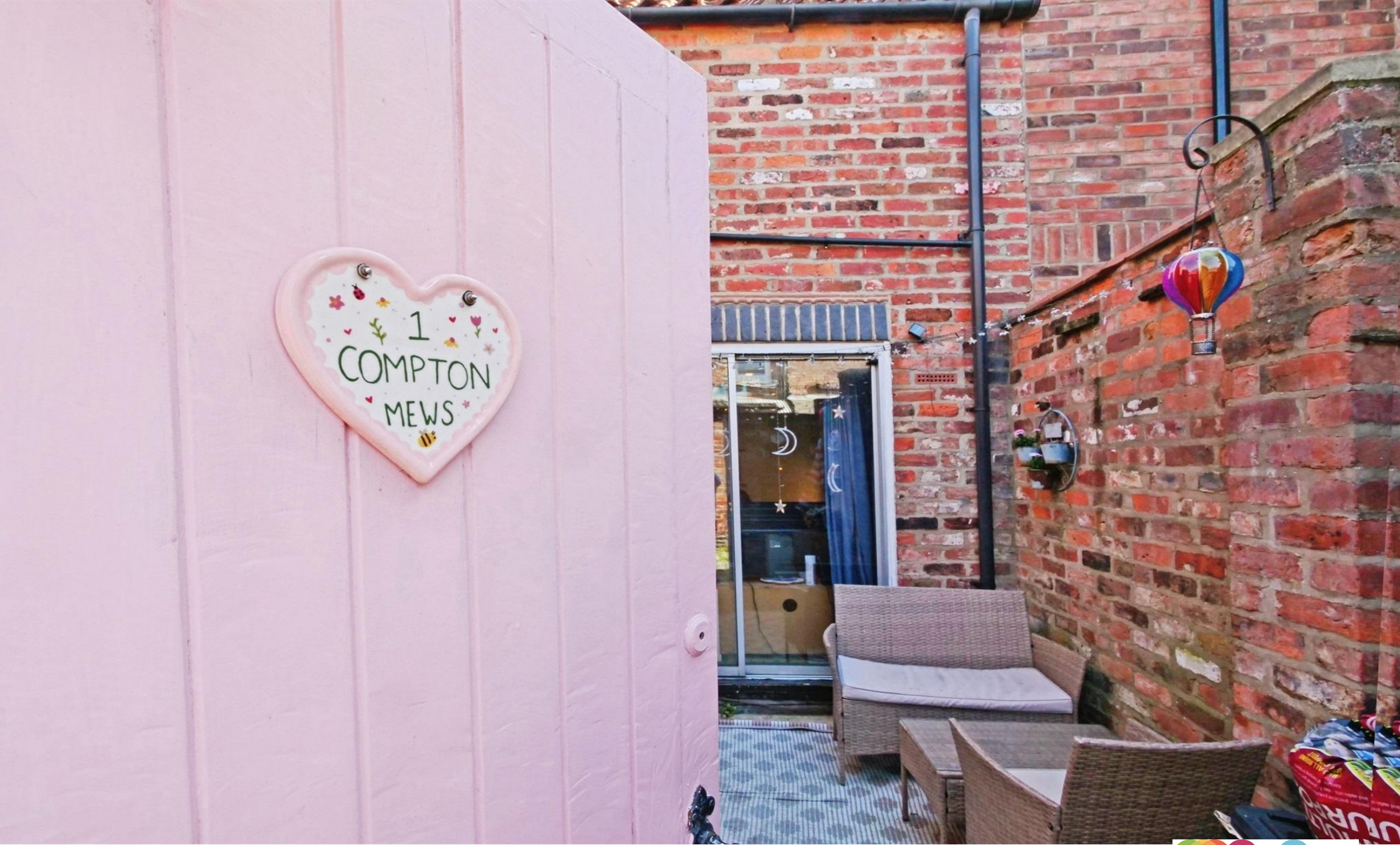
Compton Mews, York YO30 6LE