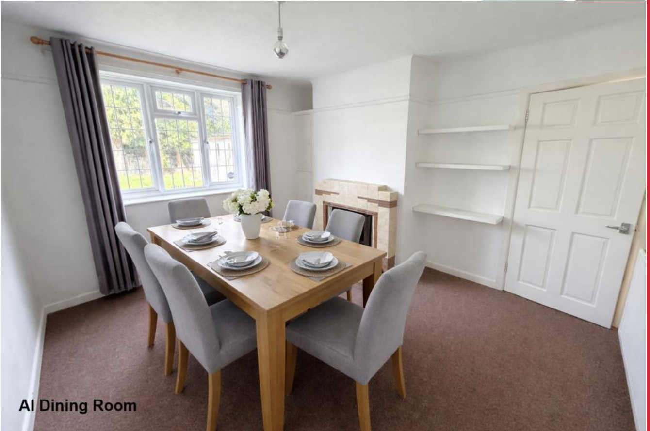
AI Dining Room