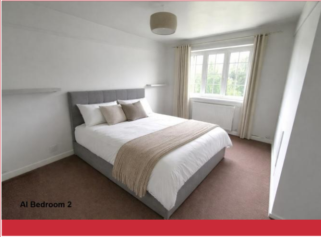
AI Bedroom 2