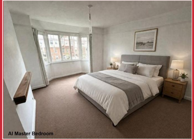
AI Master Bedroom