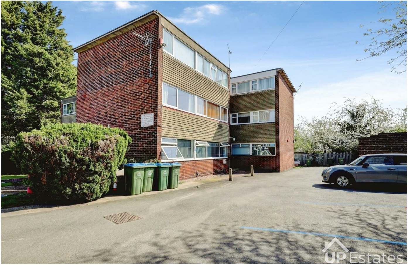
Crathie Close, Coventry