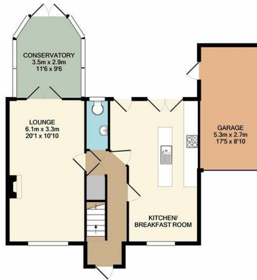
GROUND FLOOR APPROX. FLOOR AREA 75.2 SQ.M. (810 SQ.FT.)