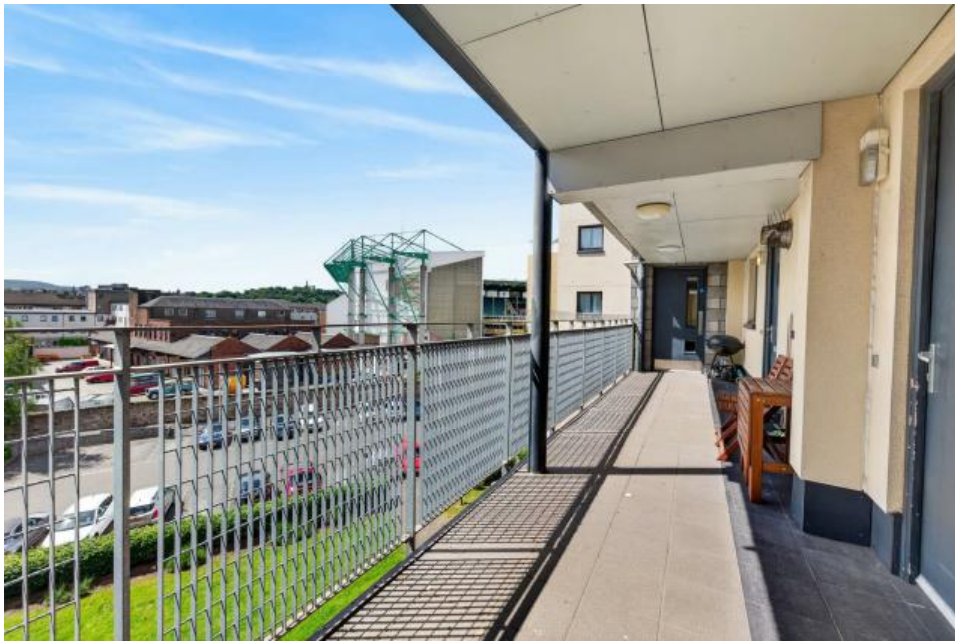
Flat 11, 4 West Kilnacre Edinburgh, EH7 5BB Approx. Gross Internal Area: 802.779 Sq Ft (56 Sq M)

For identification purposes only. Not to scale.