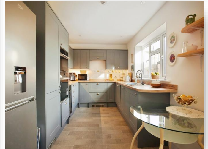
Crowns Rest Porton Road, Amesbury Salisbury SP4 7LL