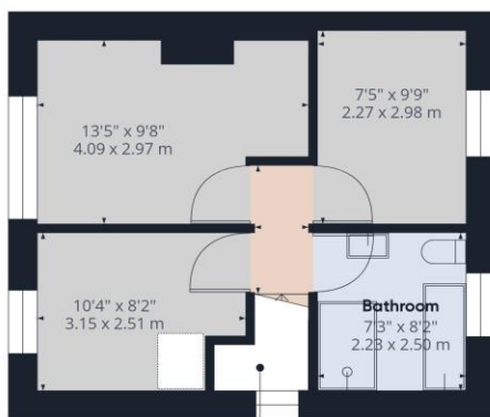
Landing 2'7" x 6'2" 0.81 x 1.89 m