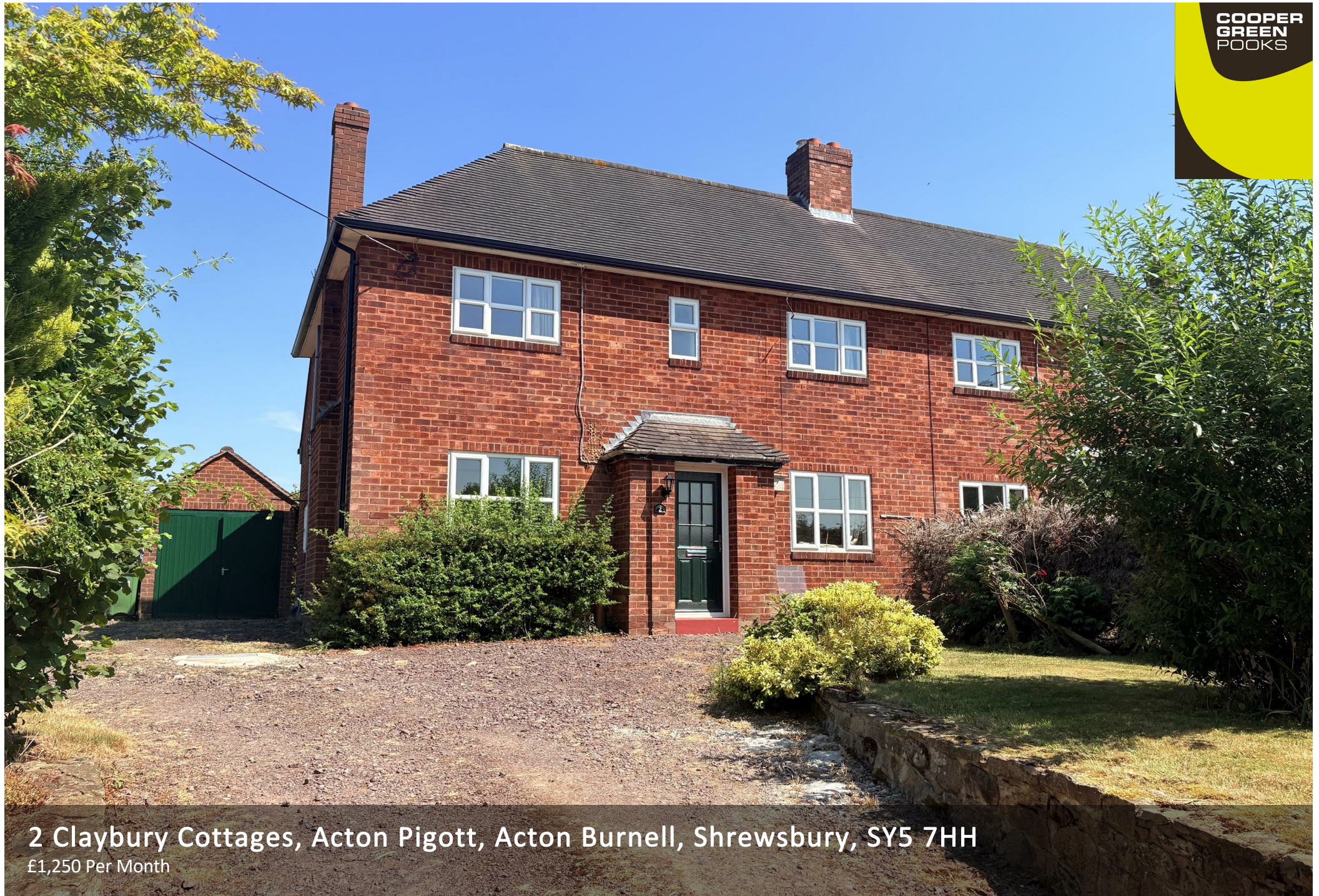
2 Claybury Cottages, Acton Pigott, Acton Burnell, Shrewsbury, SY5 7HH £1,250 Per Month