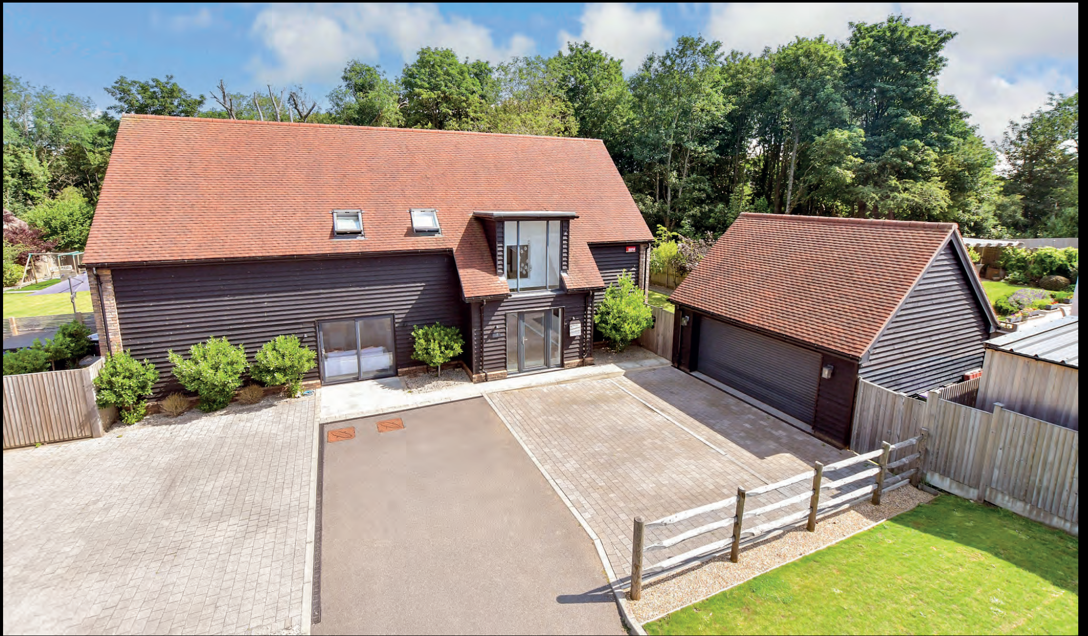
Mill Barn, 6 Windmill Close Hawkinge | Folkestone | Kent | CT18 7UE