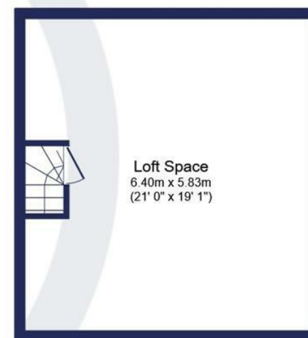
Second Floor Floor area 37.3 sq.m. (401 sq.ft.)

Total floor area: 151.5 sq.m. (1,630 sq.ft.)