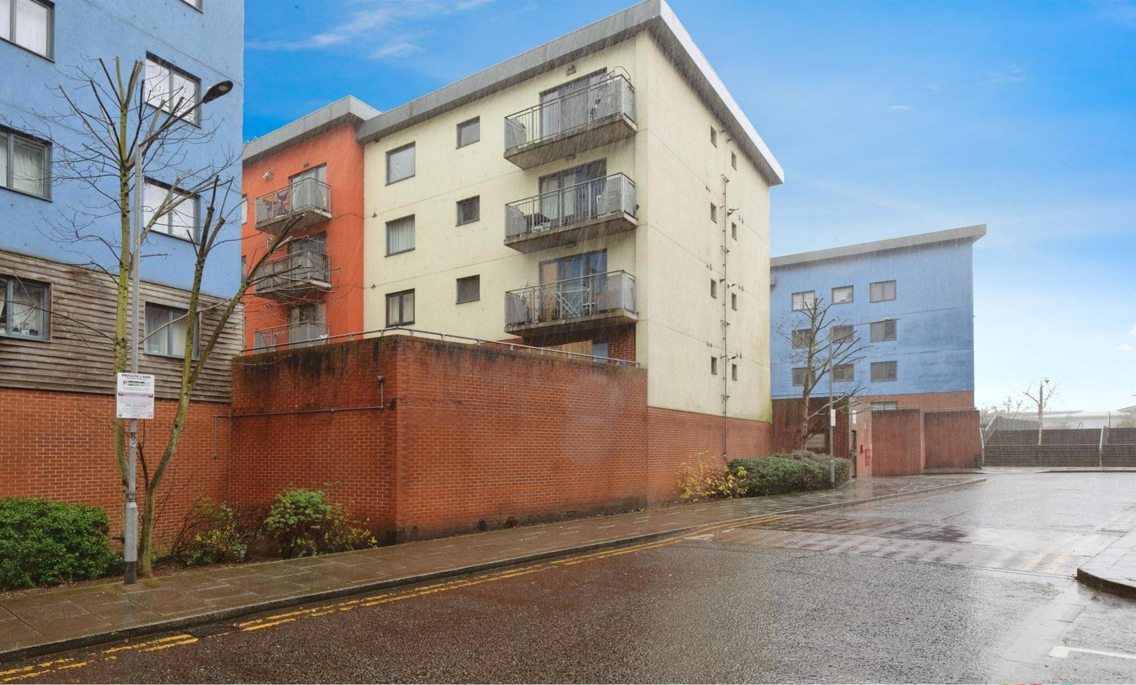
Rill Court, Spring Place, Barking, IG11 7GJ