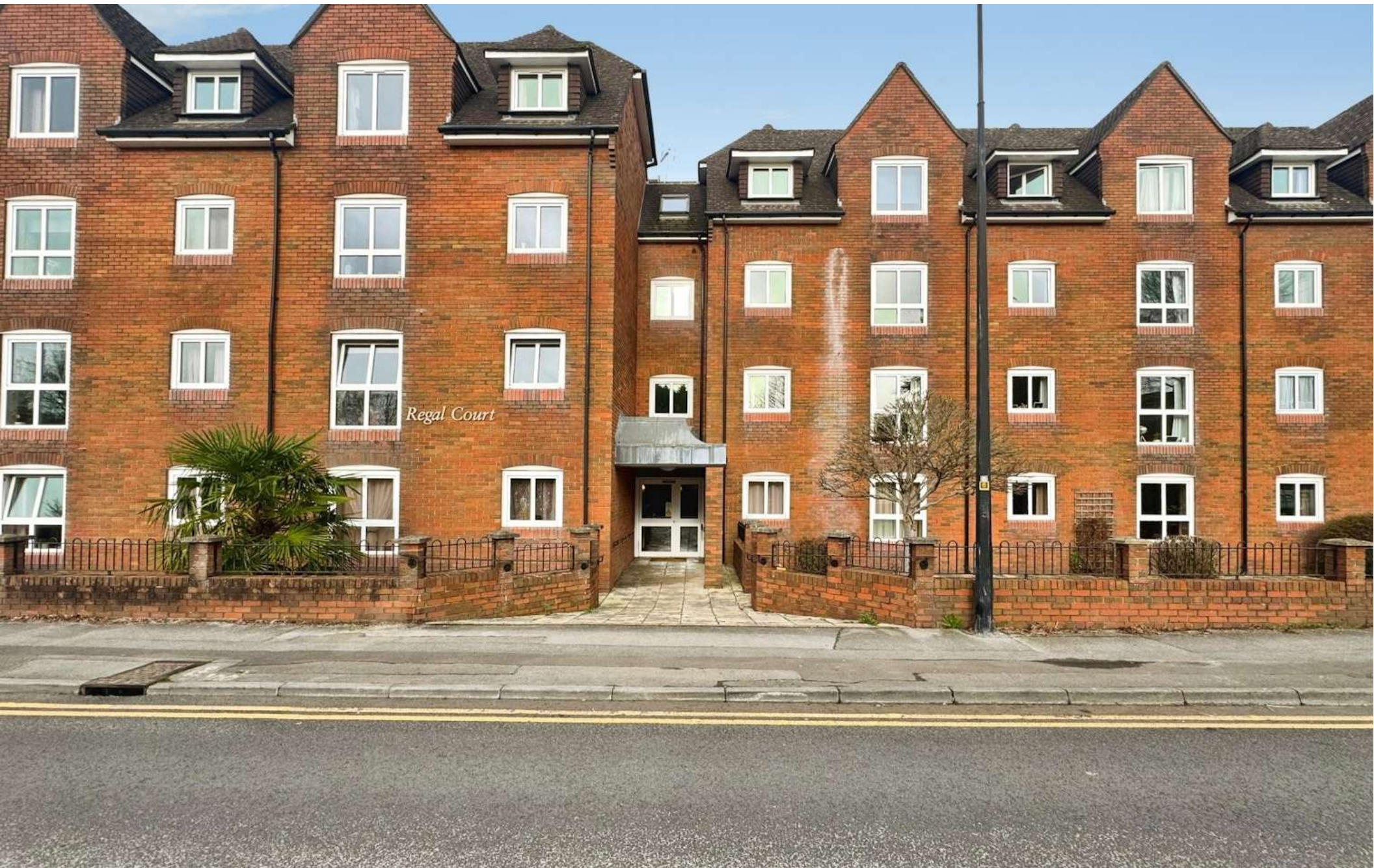
Regal Court, Warminster