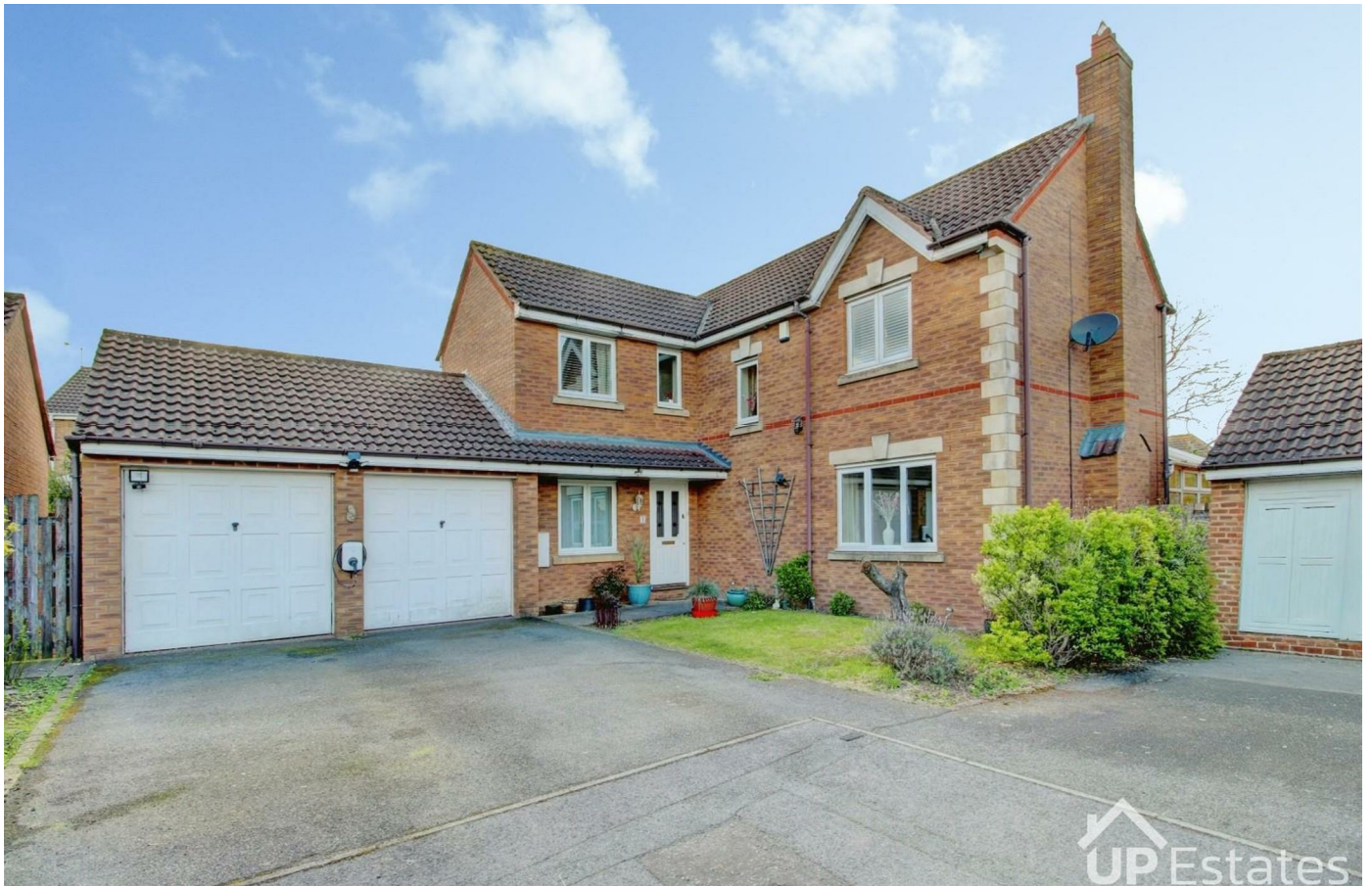
Twickenham Way, Binley, Coventry