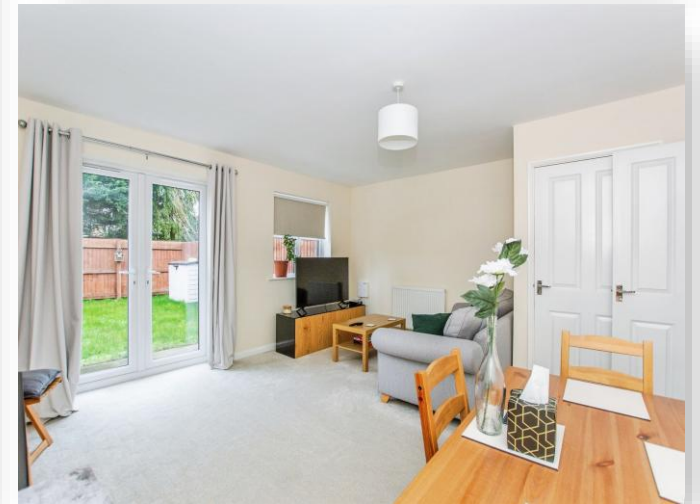
Fenmen Place, Wisbech PE13 3FA