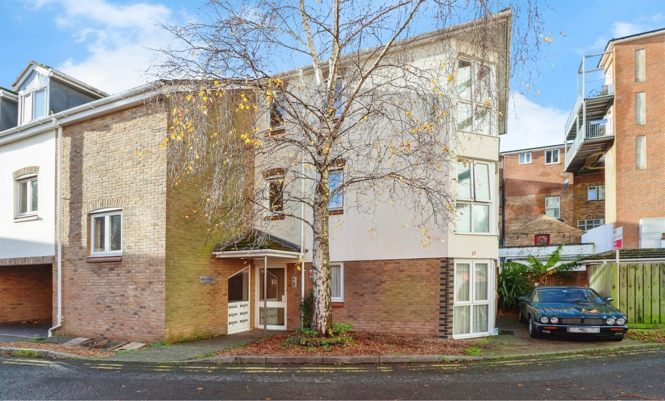
Sybil House Lansdowne Mews, BOURNEMOUTH BH1 1SJ