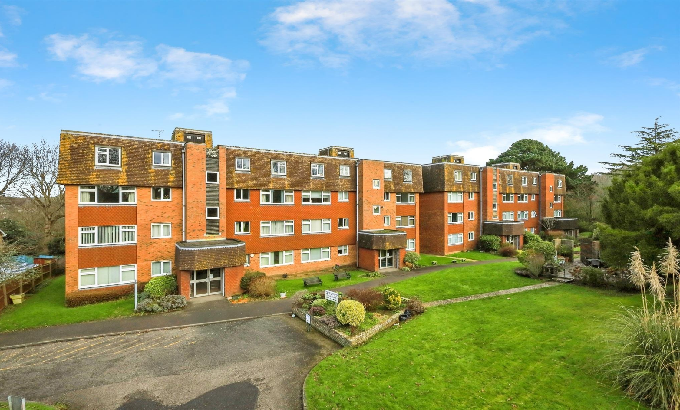
Broad Oak Coppice, Bexhill-On-Sea TN39 4PU