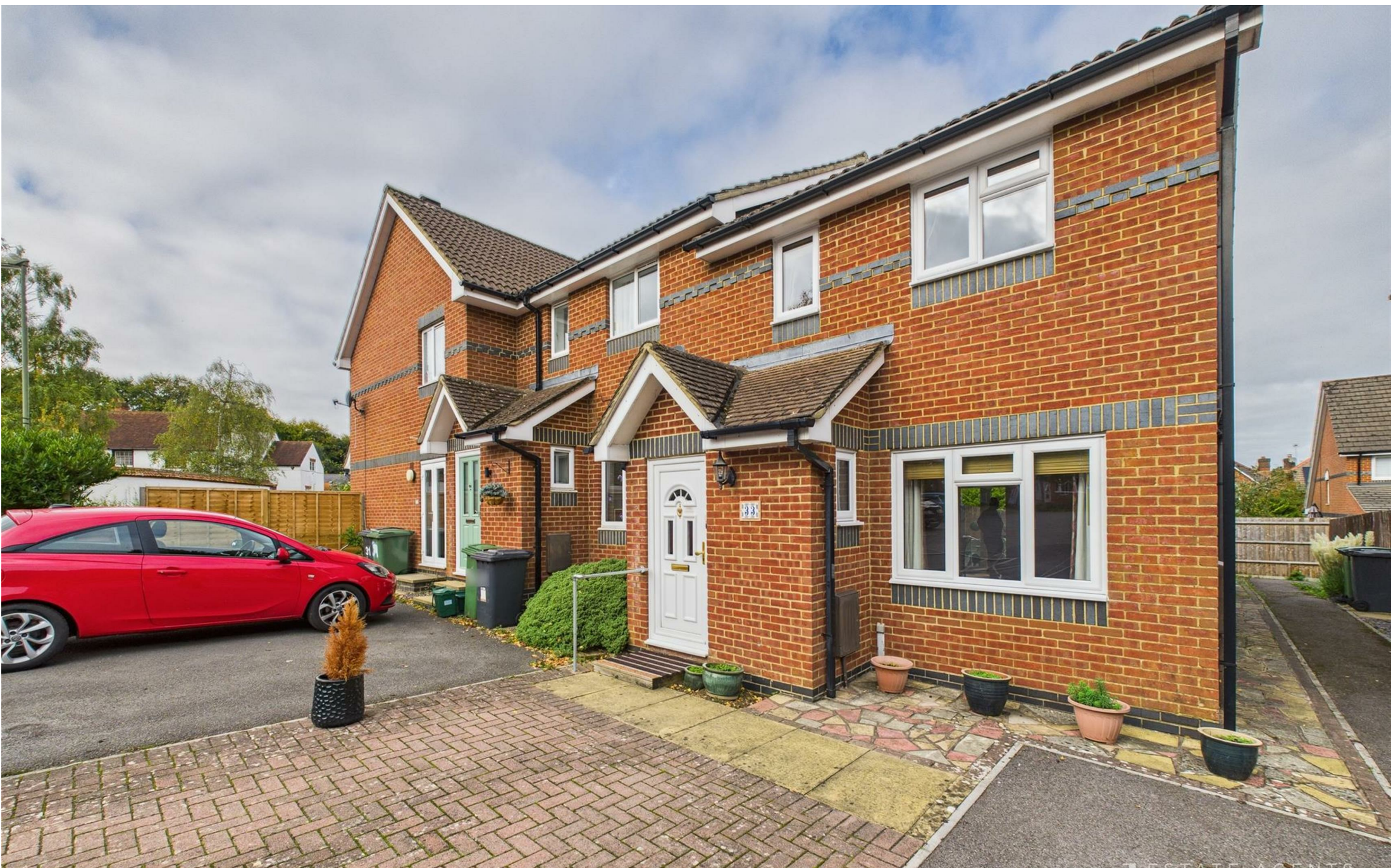
Birches Crest, Hatch Warren, Basingstoke, RG22 4RP