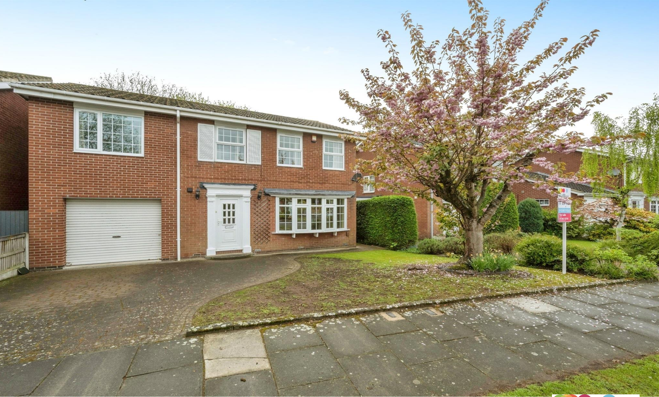
Saundby Close, Bessacarr Doncaster