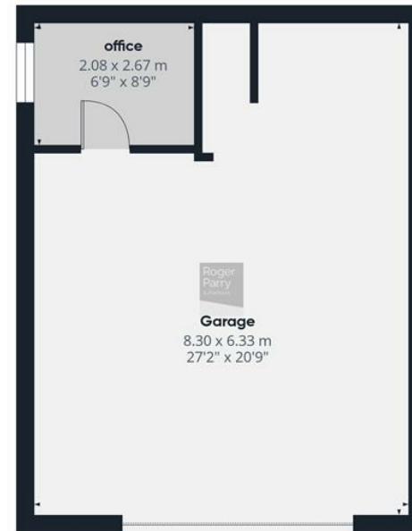
Ground floor Building 2