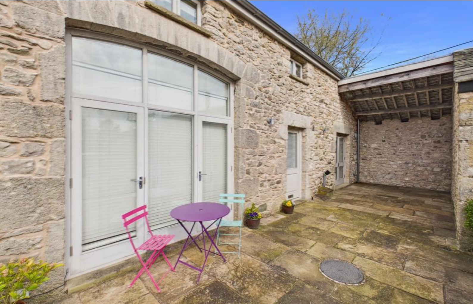
Woodview Grange Patio