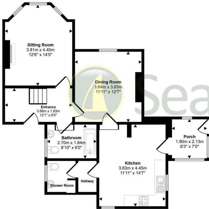
Ground Floor Approx 70 sq m / 756 sq ft

Approx Gross Internal Area 137 sq m / 1474 sq ft