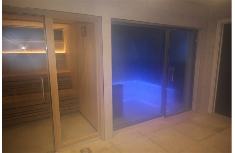
Sauna & steam room