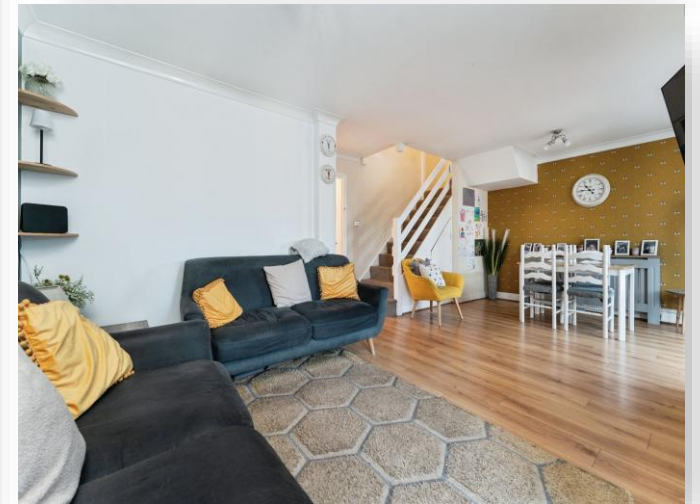
Laburnum Close, Red Lodge IP28 8LR