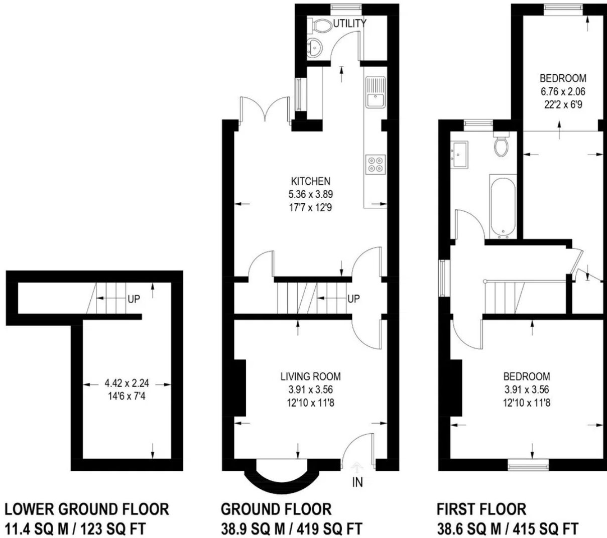
Illustration for identification purposes only, measurements are approximate, not to scale. (ID1298337)

APPROXIMATE GROSS INTERNAL AREA = 88.9 SQ M / 957 SQ FT