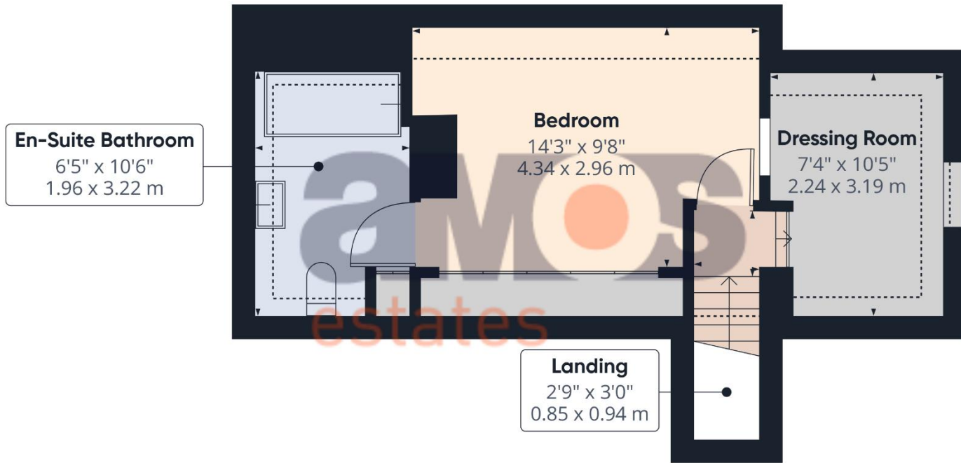
First Floor Building 1