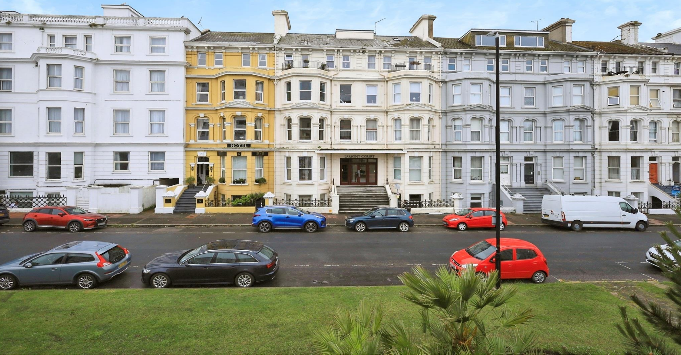
Lamont Court Wilmington Square, Eastbourne BN21 4EA