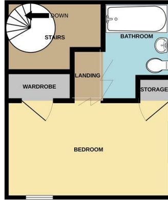
1ST FLOOR 205 sq.ft. (19.0 sq.m.) approx.