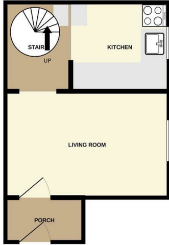
GROUND FLOOR 227 sq.ft. (21.1 sq.m.) approx.