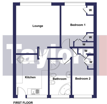
Hillside Court, Hillside Court, Lightwoods Road, DY9 0TP

FOR GUIDE PURPOSES ONLY: Whilst every attempt has been made to ensure the accuracy of the floor plan contained here, measurements of doors, windows, rooms and any other items are approximate and no responsibility is taken for any error, omission, or mis-statement. This plan is for illustrative purposes only and should be used as such by any prospective purchaser. The services, systems and appliances shown have not been tested and no guarantee as to their operability or efficiency can be given. This floor plan is provided strictly for the purpose of providing a guide and is not intended to be sufficiently accurate for any purpose. Taylors Estate Agents do not accept any responsibility for errors or misuse. Prospective buyers must always seek their own verification of a layout, or seek the advice of their own professional advisors (surveyor or solicitor).