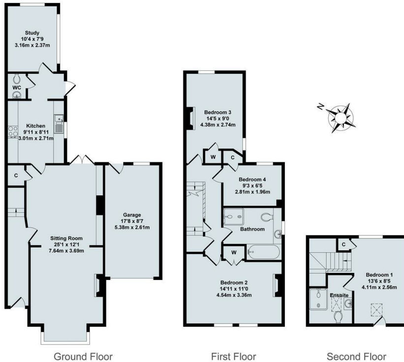
Total Approx. Floor Area 1465 Sq.Ft. (136.10 Sq.M.) All items illustrated on this plan are included in the "Total Approx Floor Area"