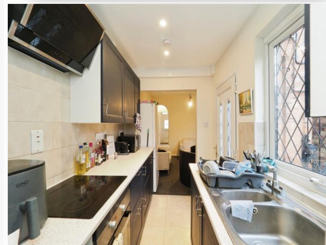
Station Street, Loughborough