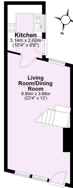
Ground Floor Approx. 30.9 sq. metres (332.8 sq. feet)