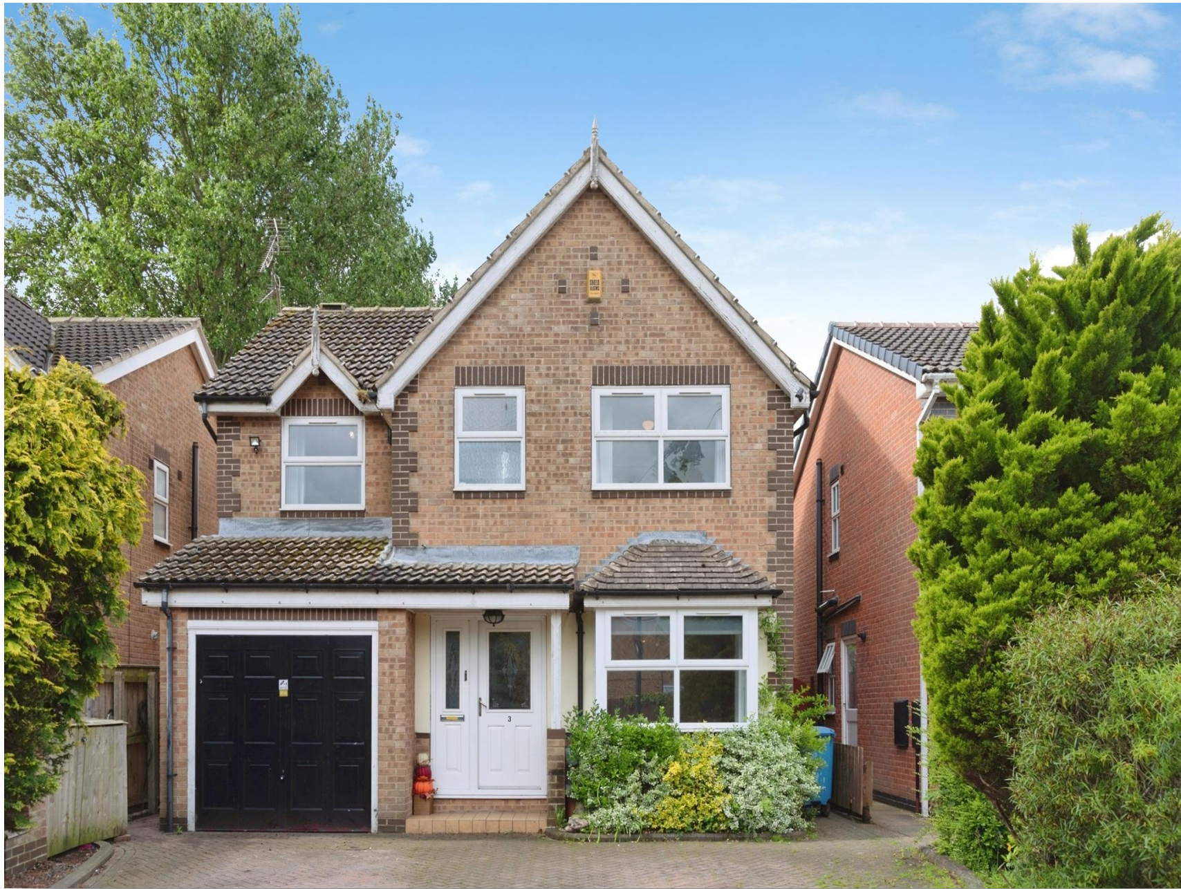
Barleigh Road, Hull, HU9 4TH