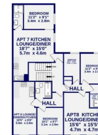
3RD FLOOR 826 sq.ft. (76.8 sq.m.) approx.