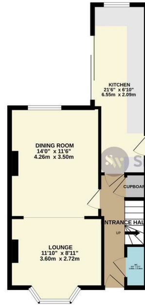
GROUND FLOOR 493 sq.ft. (45.8 sq.m.) approx.