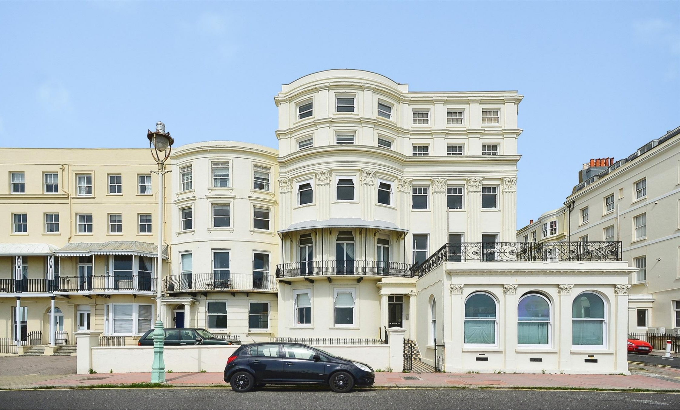
Marine Parade, Brighton BN2 1PH